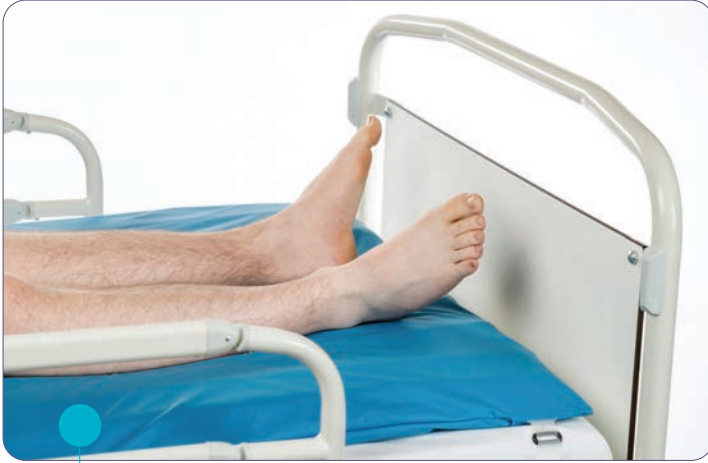
Ideal for patients at risk of a fall